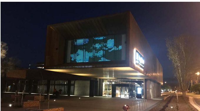
Glancing down and around at 36.1241° S, 146.8818° E. by Freya Pitt

Expressions of Interest for the 2022-2023 program close on Wednesday, June 1, 2022 at midnight