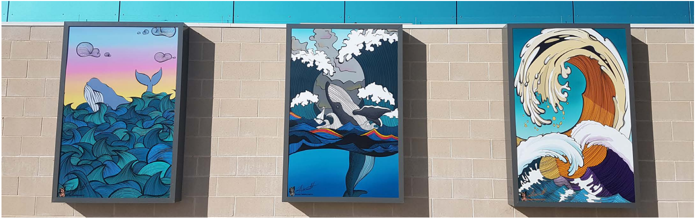
Above: WAVES Light Boxes. Whale Wave , Epic Wave , Waves for Days by Ronan Holdsworth

Wodonga Council is calling for local artists to develop three print-ready artworks responding to the theme - Water.