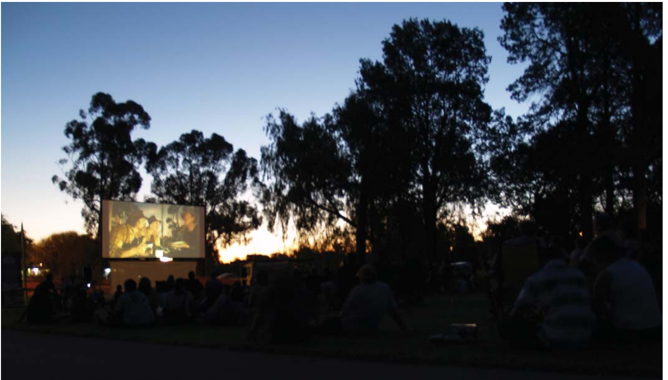
The festival screening at Colleambally.

South West Arts staff coordinated and assisted each of the organizing committees in providing and delivering information packs that included checklists, media releases, flyers as well as liaising between community, festival staff and local government.