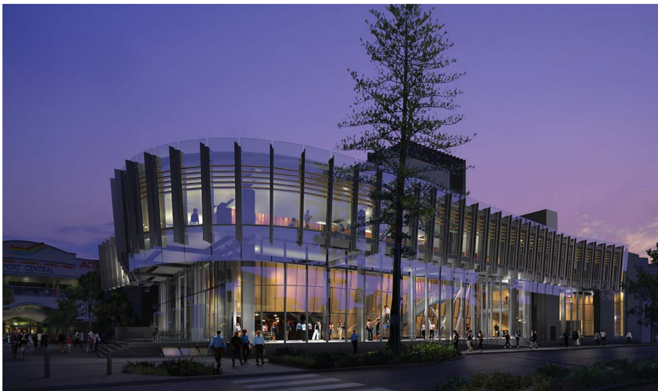
Architectural drawings of the new centre