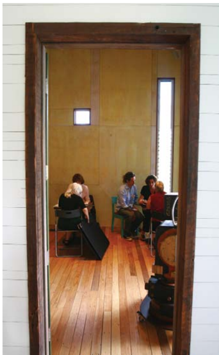
Doorway to dating.