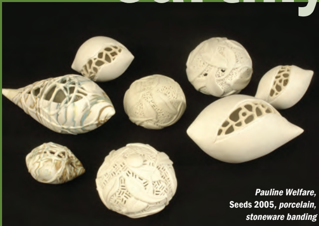
Pauline Welfare, Seeds 2005, porcelain, stoneware banding