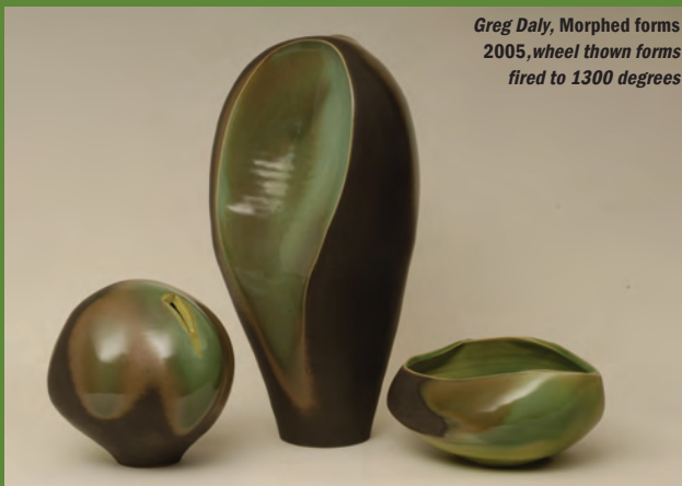
Greg Daly, Morphed forms 2005, wheel thrown forms fired to 1300 degrees