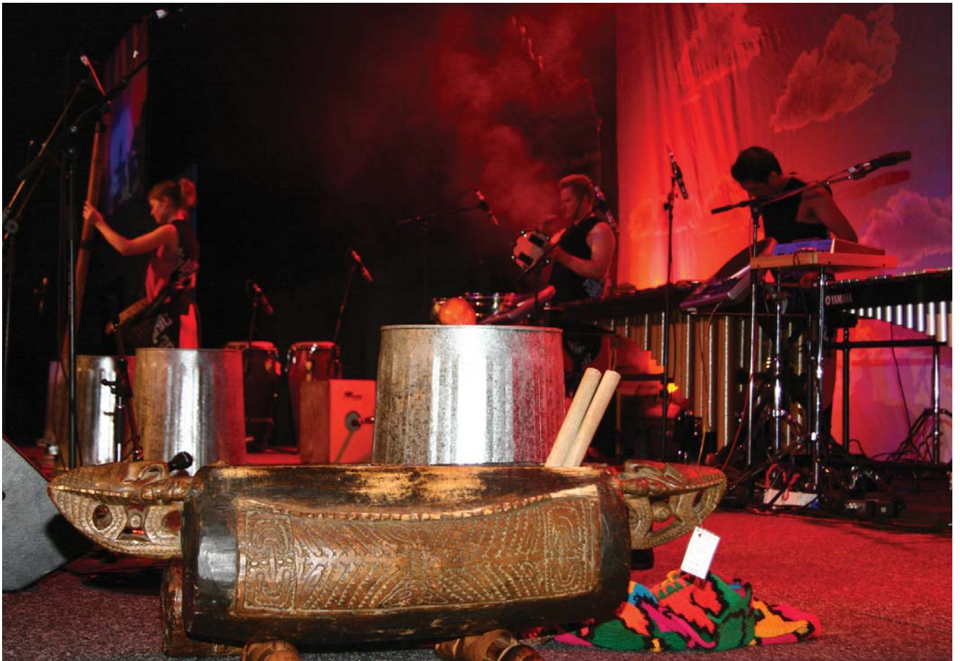
Tetrafride Percussion perform at the National Folk Festival 2007.

choirs that you can join, and many ensembles: it could be the ninety piece Balkan brass band run by Lindsey Pollok, or a Kwela whistle band from South Africa. The point is, folk festivals celebrate the joy of making music whether through song, instrumental or dance, and everyone is welcomed.